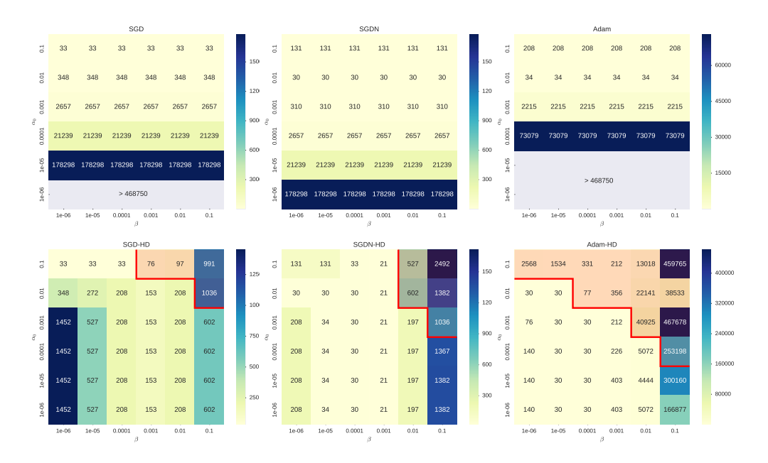
Figure 4: Grid search for selecting \alpha_0 and \beta , looking at iterations to convergence to a training loss of 0.29 for logistic regression. Everywhere to the left and below the shaded region marked by the red boundary, hypergradient variants (bottom) perform better than or equal to the baseline variants (top). In the limit of \beta \rightarrow 0 , as one recovers the original update rule, the algorithms perform the same with the baseline variants in the worst case.